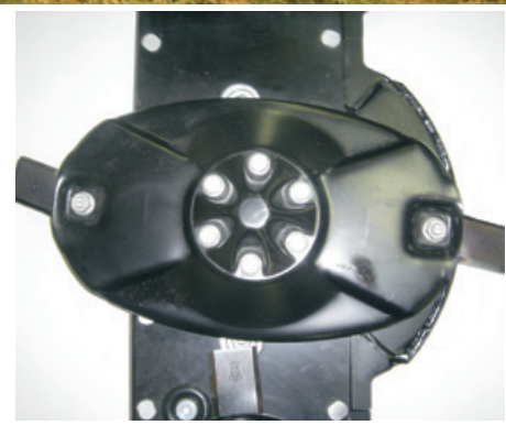
The enclosed gear-driven cutterbar uses two high-quality steel knives on each low-profile, oval disc to produce a fast, clean cut. The discs are retained with six bolts for easier service.