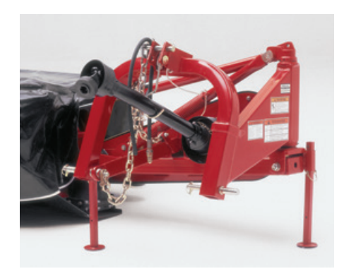
Two parking stands make tractor attachment and removal easy.